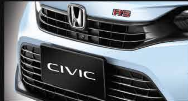
NEW GENERATION STYLE FRONT GRILL.