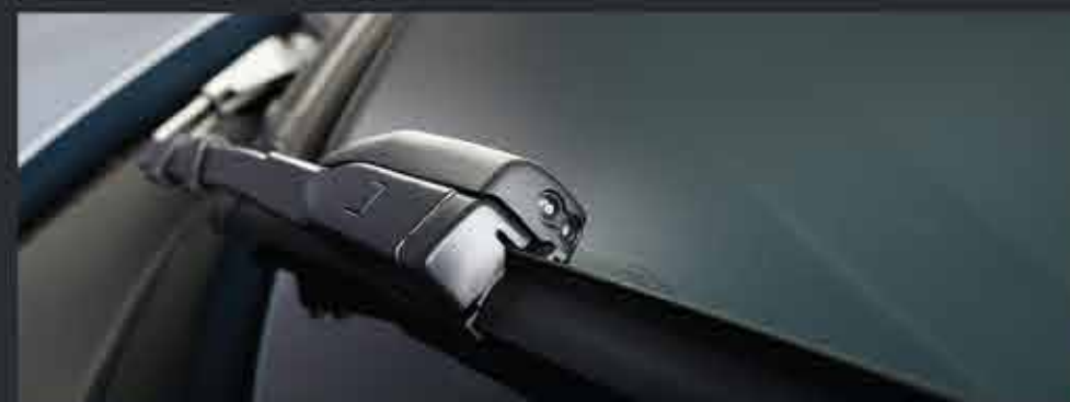
SMART CLEAR INTERMITTENT WIPERS