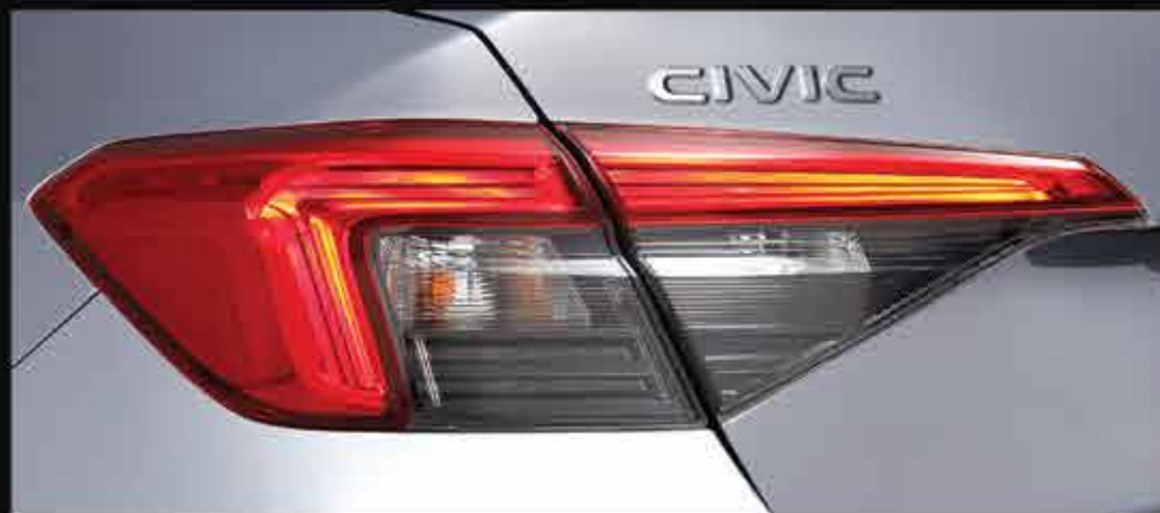
LED TAIL LIGHTS