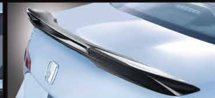
BLACK PAINTED TRUNK SPOILER