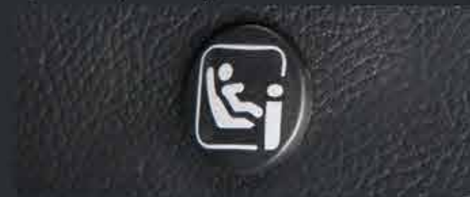
REAR SEAT ISOFIX