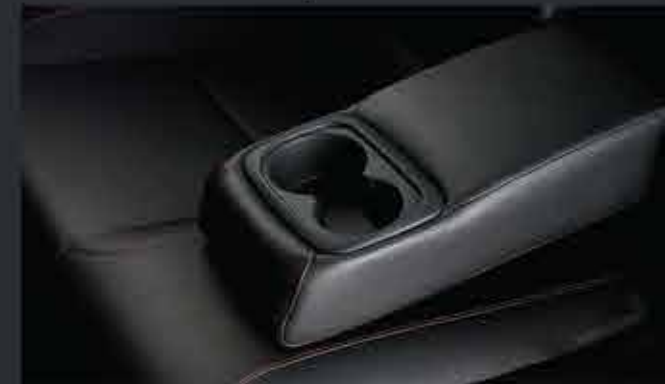
REAR SEAT ARMREST: Space to hold your beverages.