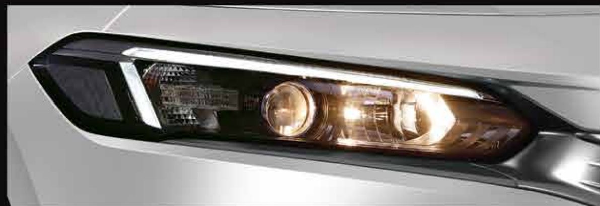
PROJECTOR TYPE HALOGEN HEADLIGHTS WITH LED DRL