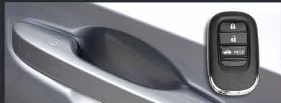
SMART ENTRY & WALK-AWAY AUTO LOCKING: Walk-away auto locking system automatically locks the car doors when the remote key is away from the vehicle.