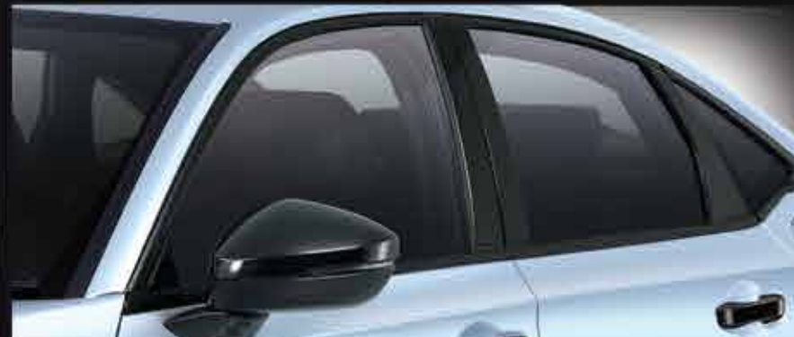
BLACK PAINTED DOOR MIRRORS: Black painted door mirrors that are retracted automatically as car doors are locked/unlocked.