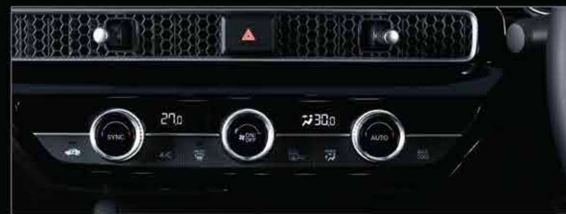
DUAL AUTO AC