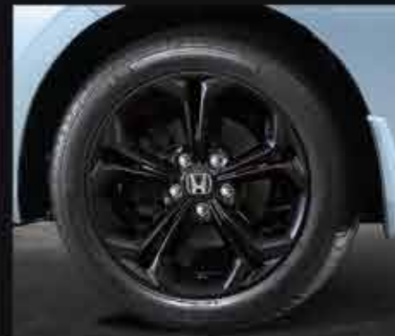
17" ALLOY WHEELS: Stunning Matte Black 17" Alloy Wheels.