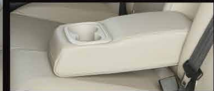
ARMREST WITH CUP HOLDER