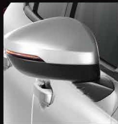
LED SIDE TURN INDICATOR