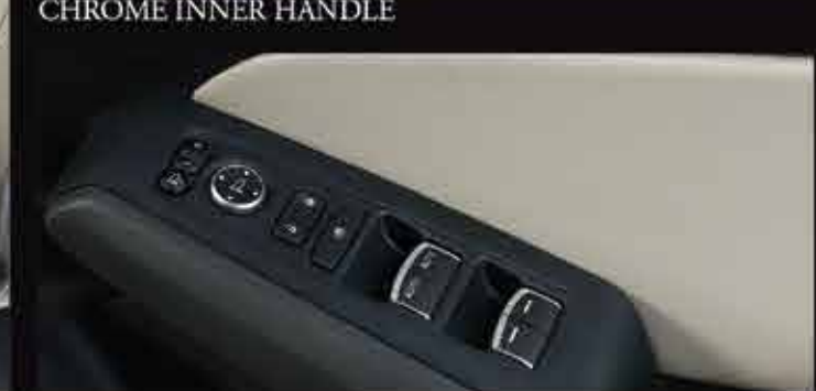
POWER WINDOW UP/DOWN DR/AS AUTO