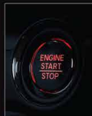
PUSH START BUTTON