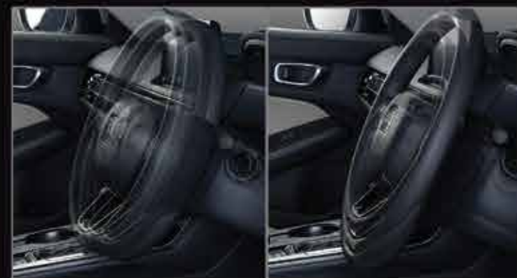
TILT & TELESCOPIC STEERING: Helps to adjust the steering wheel according to the driver's height by moving the wheel through tilted and telescopic movement.