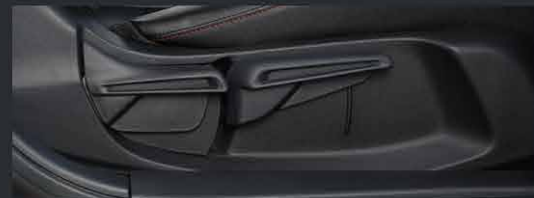
DRIVER SEAT HEIGHT ADJUSTER: Personalize the driving position by adjusting seat the way you like.