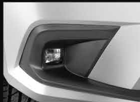
LED FOG LIGHTS