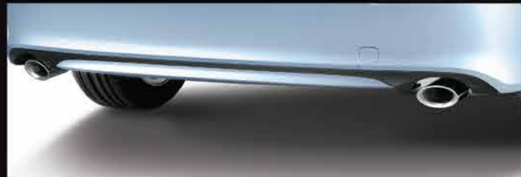
DUAL EXHAUST: New Dual Exhaust System helps optimize air flow.