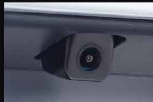
DYNAMIC REAR VIEW CAMERA