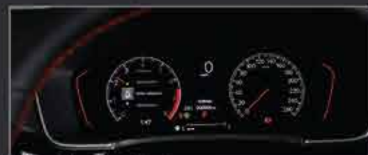
Driver Attention Monitor