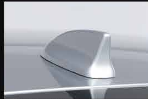
SHARK FIN ANTENNA