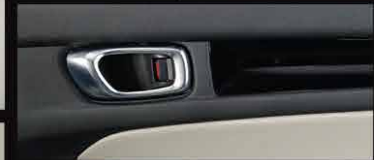
CHROME INNER HANDLE