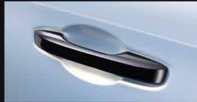
BLACK PAINTED DOOR HANDLES: Highly impressive black painted door handles.