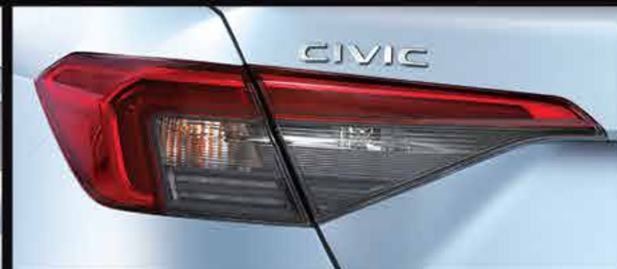
LED TAIL LIGHTS