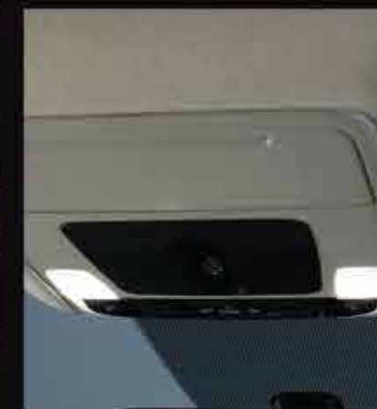
INTERIOR LED LIGHTS