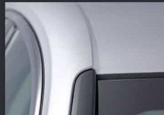
LAZER BRAZED ROOF (NOISELESS ROOF): Realization of the sleek design by applying brazing to the roof.