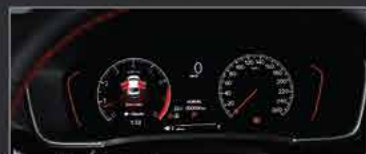
Open Door Indication