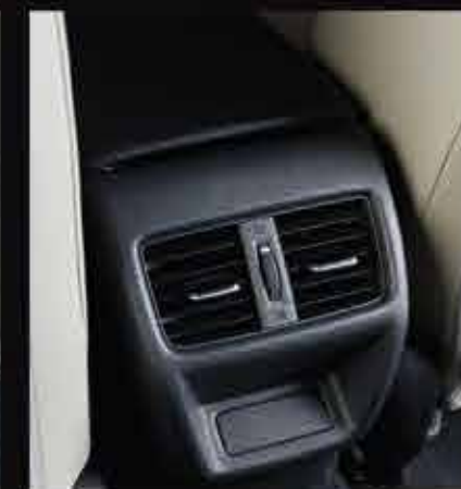
REAR AC VENTS