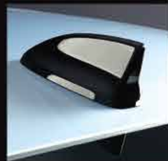
STYLISH BLACK PAINTED SHARK FIN ANTENNA