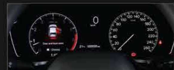
7" TFT Driver Information Interface