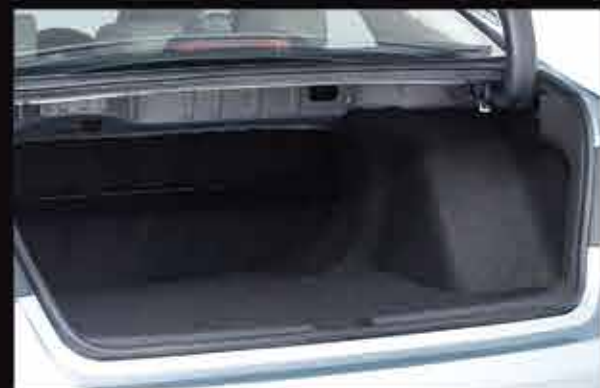
ONE TOUCH SELF OPENING TRUNK