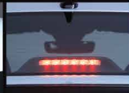
HIGH MOUNT LED STOP LAMP