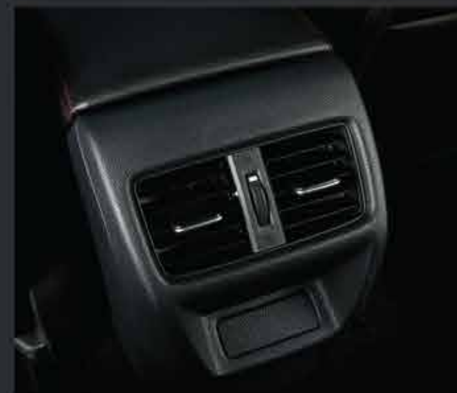
REAR AC VENTS: Gives a new meaning to temperature control making the whole cabin comfortably cool.