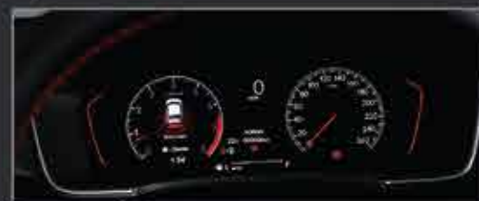
Boot Open Indication