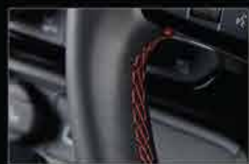
LEATHER WRAPPED STEERING