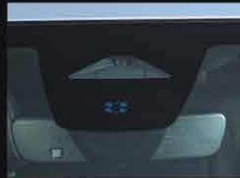
RAIN SENSOR: Automatically activate wipers.