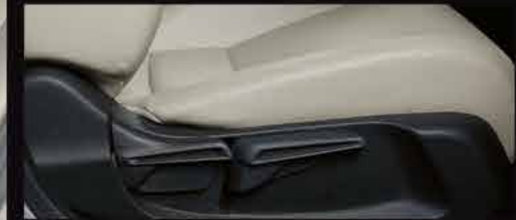
DRIVER SEAT HEIGHT ADJUSTER