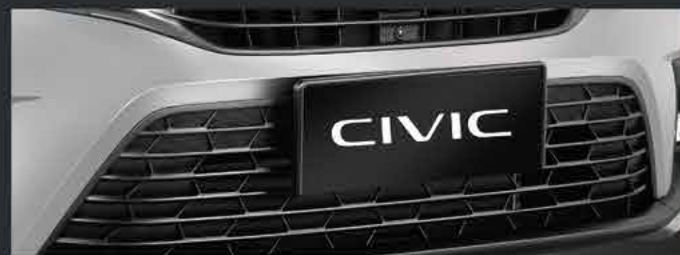
NEW GENERATION STYLE FRONT GRILL