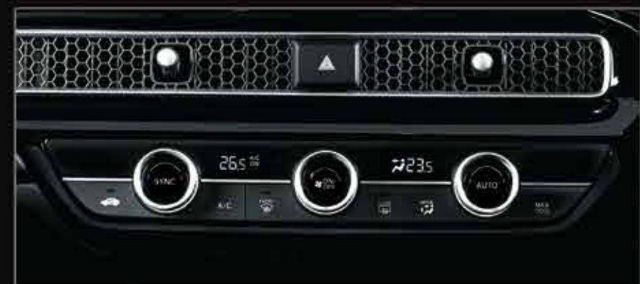
DUAL AUTO AC: Auto temperature control will ensure a pleasureable cabin throughout your trip with Drive/Assistance separate temperature setting.