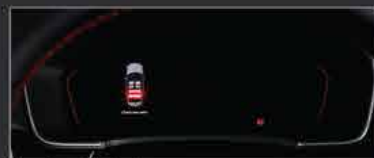
Rear Seat Reminder