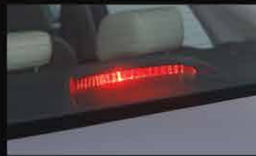
HIGH MOUNT STOP LAMP