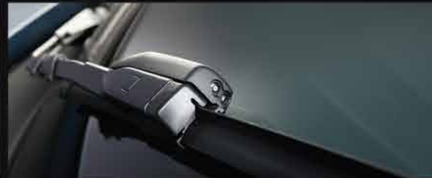
SMART CLEAR AUTO WIPERS: Water goes through the nozzles installed in the wiper for precise and detailed cleaning of the windscreen.