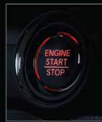
PUSH START BUTTON