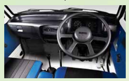
Newly designed instrument panel with New 4 spoke steering.

With upgraded features and advanced Euro-II technology, now your Suzuki Bolan is more environment friendly. Now drive the extra mile, with high standard engine performance in low fuel consumption and inexpensive maintenance that let your savings augment in an economical way!