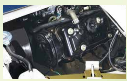
New EFi Engine.